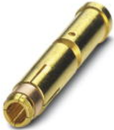
Crimp contact, turned, contact diameter: 2 mm, crimp range: 1.5 mm 2 ... 2.5 mm 2

Please be informed that the data shown in this PDF Document is generated from our Online Catalog. Please find the complete data in the user's documentation. Our General Terms of Use for Downloads are valid ( http://phoenixcontact.com/download )