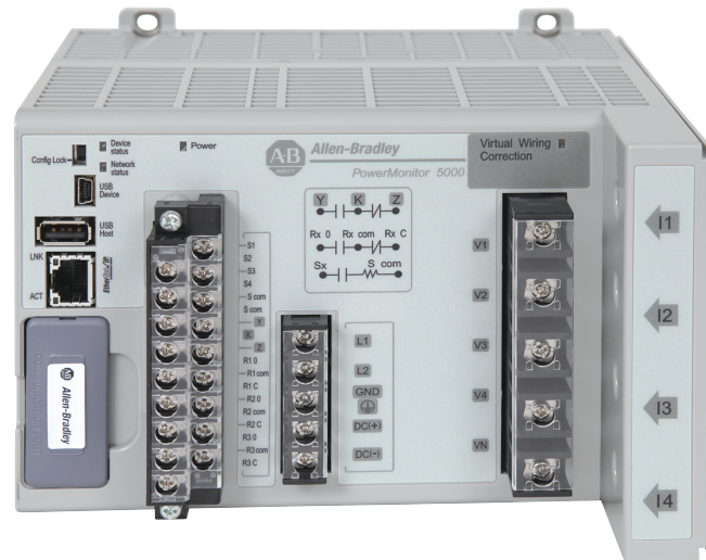
Allen-Bradley PowerMonitor 5000